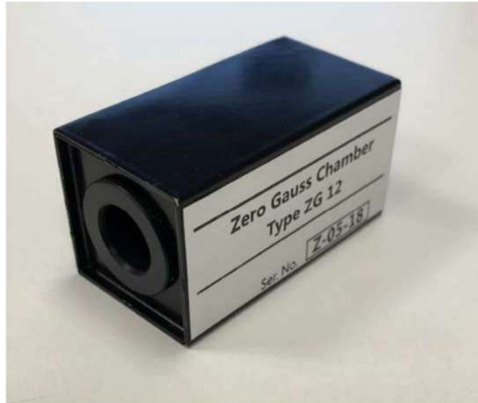
Figure 1. Zero Gauss Chamber type ZG-12-LN

The SENIS Zero Gauss Chamber model ZG-12-LN is a magnetic shielding accessory that is specially designed to support the SENIS ultra-low noise Hall probes used with the high-accuracy Digital Teslameters 3MH5.