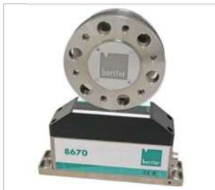
Rotor incl. Stator